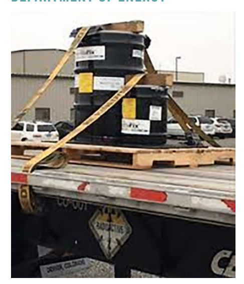
The U.S. Department of Energy continues to make progress toward the start of vitrifying Hanford's low-activity tank waste under the Direct-Feed

Low-Activity Waste program. In parallel with the program, the Department is evaluating additional technology options to potentially accelerate treatment and disposal of Hanford low-activity tank waste. One such approach is the Test Bed Initiative (TBI) Demonstration Project. The Department is announcing two decisions today that represent the next steps in moving forward with the demonstration. First, the Department has submitted a request to the Washington State Department of Ecology for a permit.