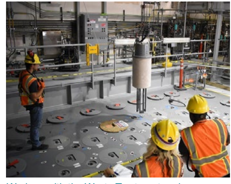
Workers with the Waste Treatment and Immobilization Plant tour and learn about Melter 1 at the Low-Activity Waste Facility on the Hanford Site. Tank waste will be mixed with glass-forming materials and heated in melters in a process known as vitrification, or immobilization in glass.

and analyze technologies and other opportunities to get waste safely out of tanks, treated and disposed of sooner, driving down risks to workers, the public, and the environment.